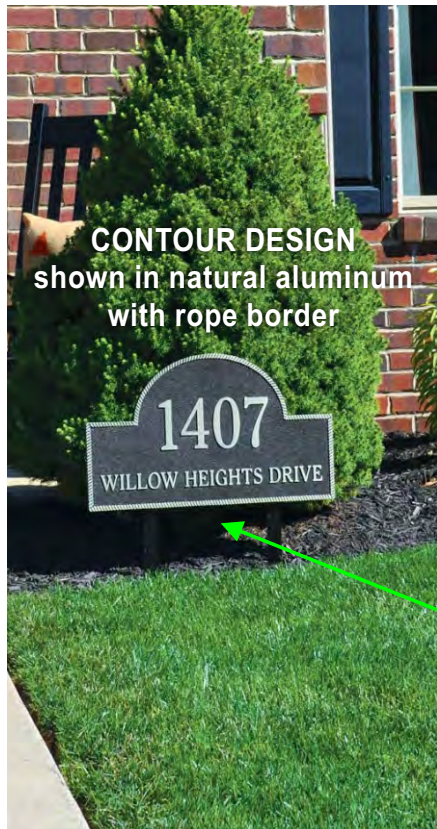
CONTOUR DESIGN shown in natural aluminum with rope border

SoCal Bronze residential address plaques are from foundry and are high quality sand cast, weather-resistant and cast to your specifications.