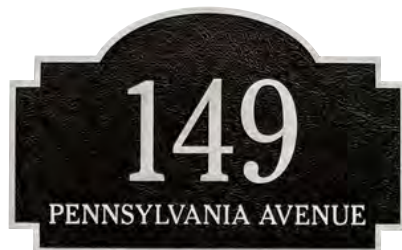
CUSTOM CONTOUR - $200 16" x 10" (Shown in Aluminum Finish)