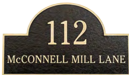
CONTOUR - $275 24" x 14"