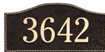
SINGLE LINE SERPENTINE - $165 12" x 6" (Shown with Rope Border) Line 1 Only