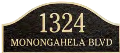
SLIM SERPENTINE - $180 16" x 7"

*Numeral height is less than 3" when two lines are used